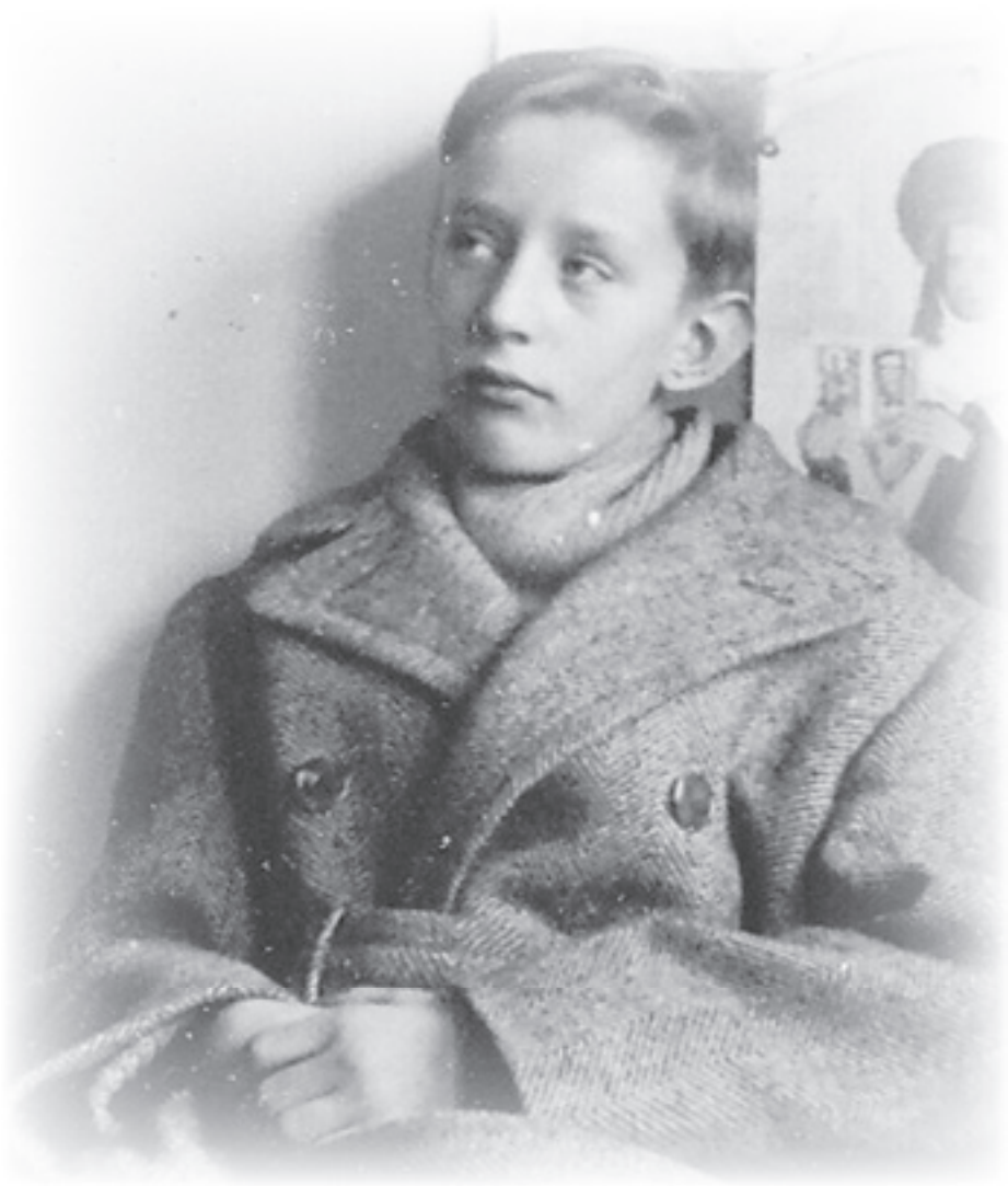
La Margelle Public enemy